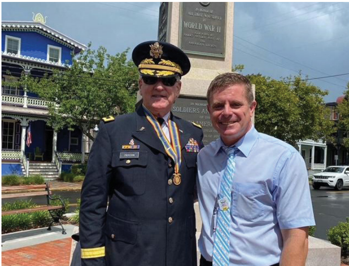
LTC Alfred H. M. Shehab Chapter, NJ