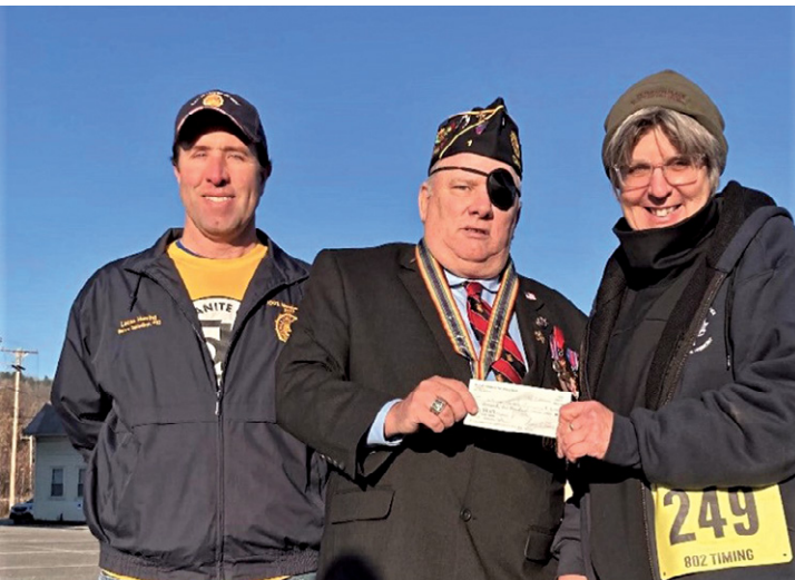
MG Chamberlain Chapter, ME