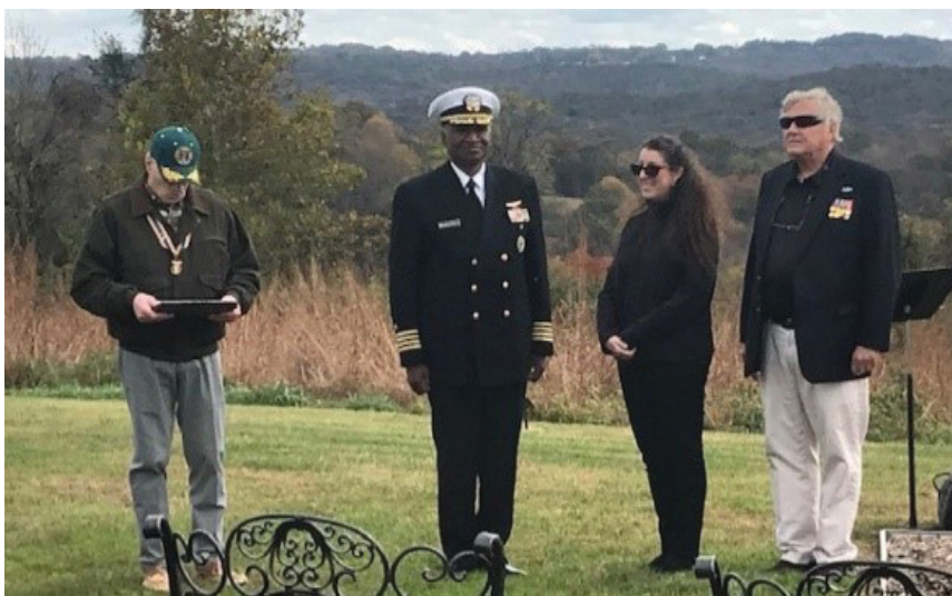
Below: Historical reenactors participated in the 21-bell salute honoring the fallen.