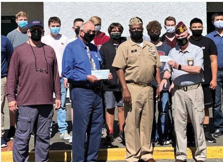
Puget Sound Chapter, WA