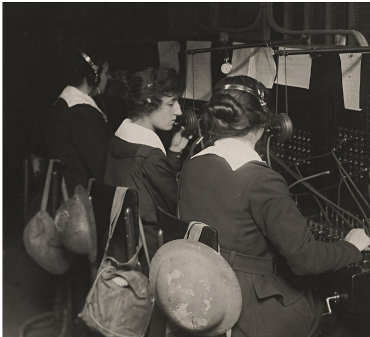
With their gas masks and helmets slung over their chairs, the women of the Signal Corps connected messages that dealt with top-secret information.

As described by one of the operators: Every order for an infantry advance, a preparatory barrage to the taking of a new objective, and, in fact, for every troop movement, came over the ‘fighting lines,’ as we called them.