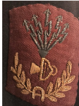
Chief Operator's Emblem

The operators received promotions and carried positions like anyone else in the Army at that time. The “Stars and Stripes” on 29 March 1918 identified the rank of the Hello Girls as follows: “Their ranks were identified by white Armbands. An Operator First Class wore the white armband with an outlined blue Telephone