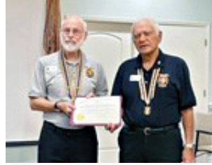
Sun City Center Chapter, FL