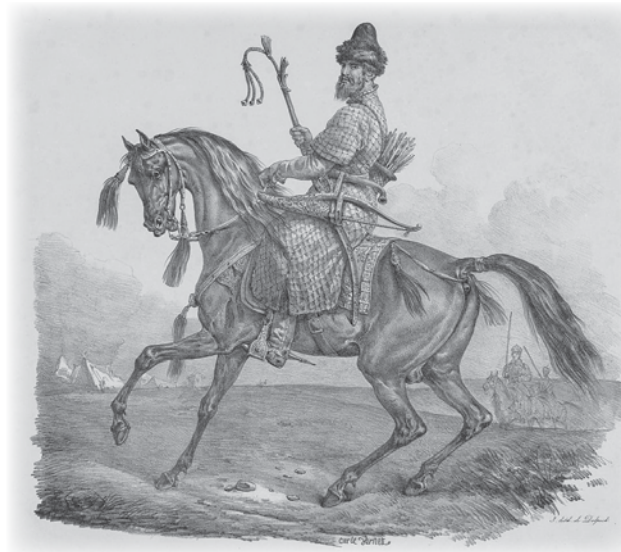
Cossack Cavalier, c. 1820. by Carle Vernet; Cleveland Museum of Art

Since the beginning of Ukrainian history, its inhabitants have fought, won and lost their freedom on multiple occasions. In the mid-1600s, the Cossacks rebelled against the Polish-Lithuanian Commonwealth to establish the Cossack Hetmanate. This autonomy lasted over 100 years despite constant pressure by Russian Czars. It became part of Russia near the end of the 18th Century.