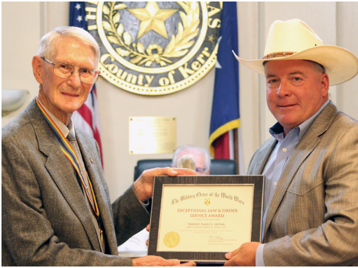
Hill Country Chapter, TX