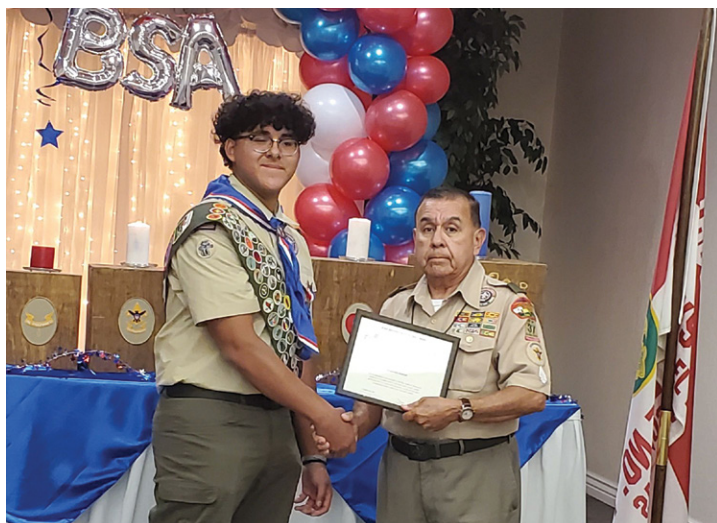
Greater El Paso Chapter, TX