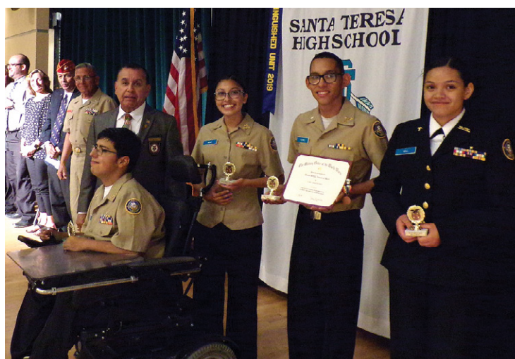
Each year, MOWW presents ROTC and JROTC Awards of Merit to outstanding cadets. Pictured: Companions of the Greater El Paso Chapter (TX), recognize JROTC Cadets at St. Teresa High School in 2019.

the chapters area of responsibility, but in actuality, it is the link to all youth in college, high school, middle school and elementary school. What does Outreach really mean? It is not only working with schools with ROTC/JROTC programs to provide awards, speakers, and volunteers but the same may