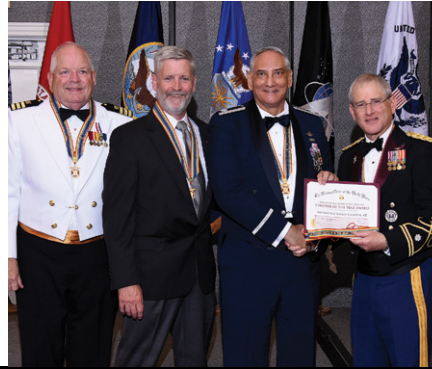
SANTA CRUZ VALLEY CHAPTER, AZ