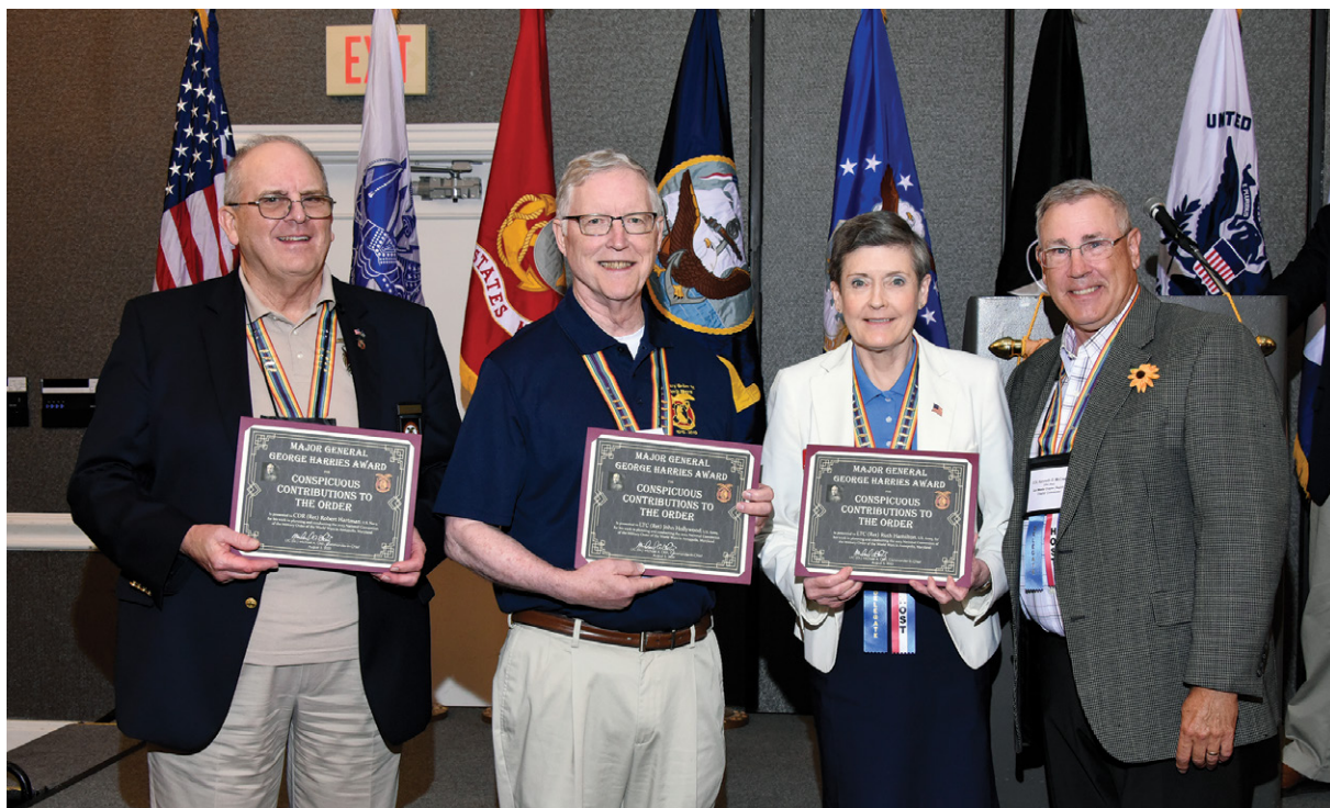
The Major General George Harries Award was presented to General Meade Chapter Companions for planning and conducting the 2023 National Convention.

God Bless all our Companions and families, the Military Order of the World Wars, and the United States of America. Thank you! ★