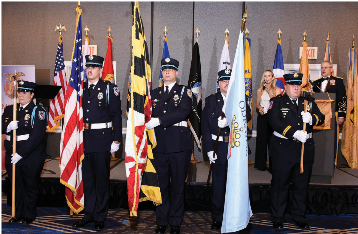
The Odenton Volunteer Fire Department of Maryland served as the Honor Guard for the CINC's Banquet.