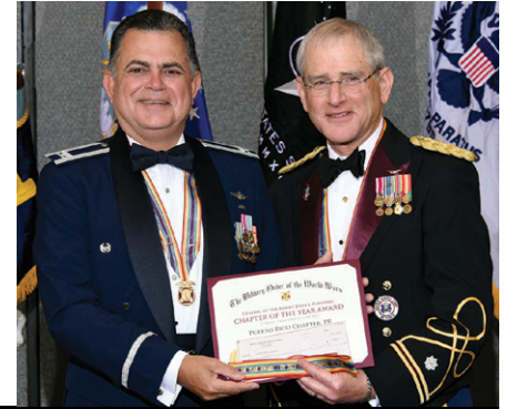
PUERTO RICO CHAPTER, PR