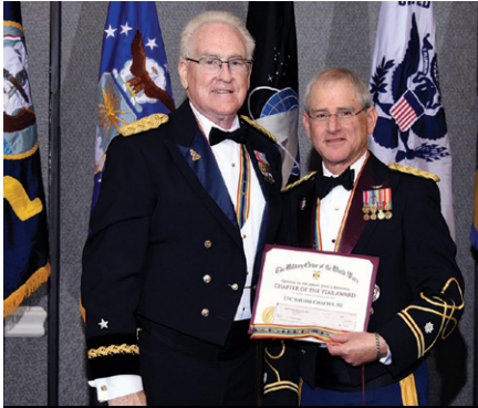
LTC SHEHAB CHAPTER, NJ